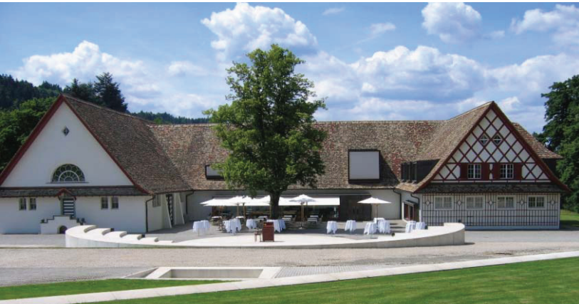
Module 1: Credit Suisse Learning Center "Bocken" – Horgen/Zurich