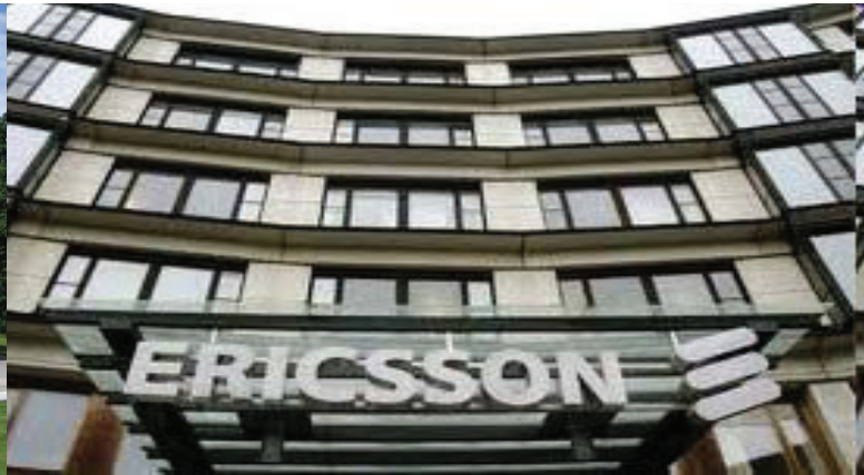
Module 2: Ericsson Global Headquarters, Stockholm